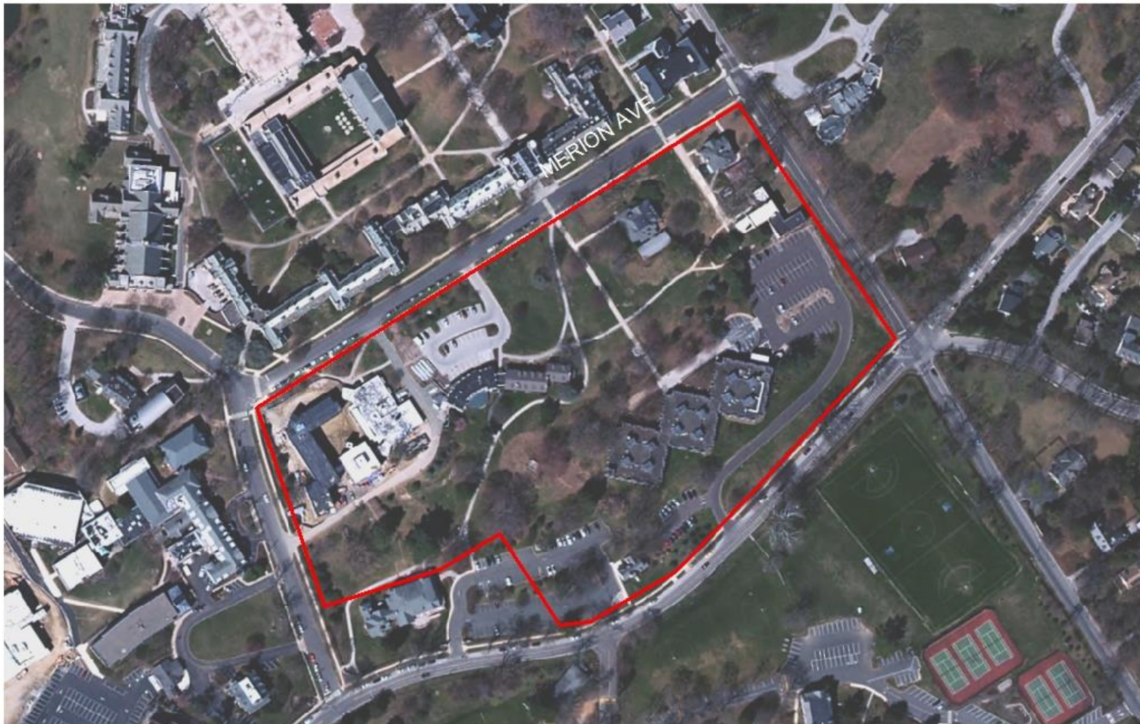
Student Life and Wellness Center 130160003