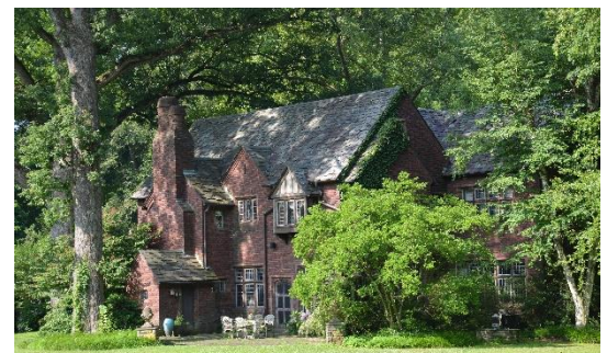
1835 County Line Road Dwelling