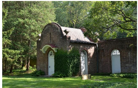
1800 W. Montgomery: Current photo of the greenhouse complex