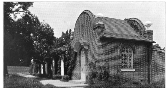
1800 W. Montgomery Avenue: Historic photo of the greenhouse complex

1800 West Montgomery Avenue contains structures relating to Stoneleigh’s agricultural operations. The group of buildings, walls, and other elements were designed by Frank Miles Day & Brother to fit within the larger landscape plan designed by Olmsted Brothers. The intact elements of the property include the superintendent’s cottage, various brick walls, and a group of small buildings associated with the operations of the greenhouse. A majority of the footprint of the former greenhouse has been replaced by a tennis court, though a small portion of an original greenhouse remains. The property is a good example of the architecture of Frank Miles Day, whose work includes three Class II-designated resources on the Township’s Historic Resource Inventory and a wide variety of notable buildings in the Philadelphia area. When new, the garden complex was considered significant enough to merit a five-page article in a 1903 issue of “House and Garden” magazine. The article described the architecture glowingly: “That [utilitarian] buildings can be made objects of beauty and also an attraction of the estate is shown... Here is an ingenious grouping of not only the greenhouses themselves, but of all their accompaniments, including the horses and teams engaged upon the garden work. All of this is enclosed within distinctly defined boundaries to which are added details of a charming architectural character.”