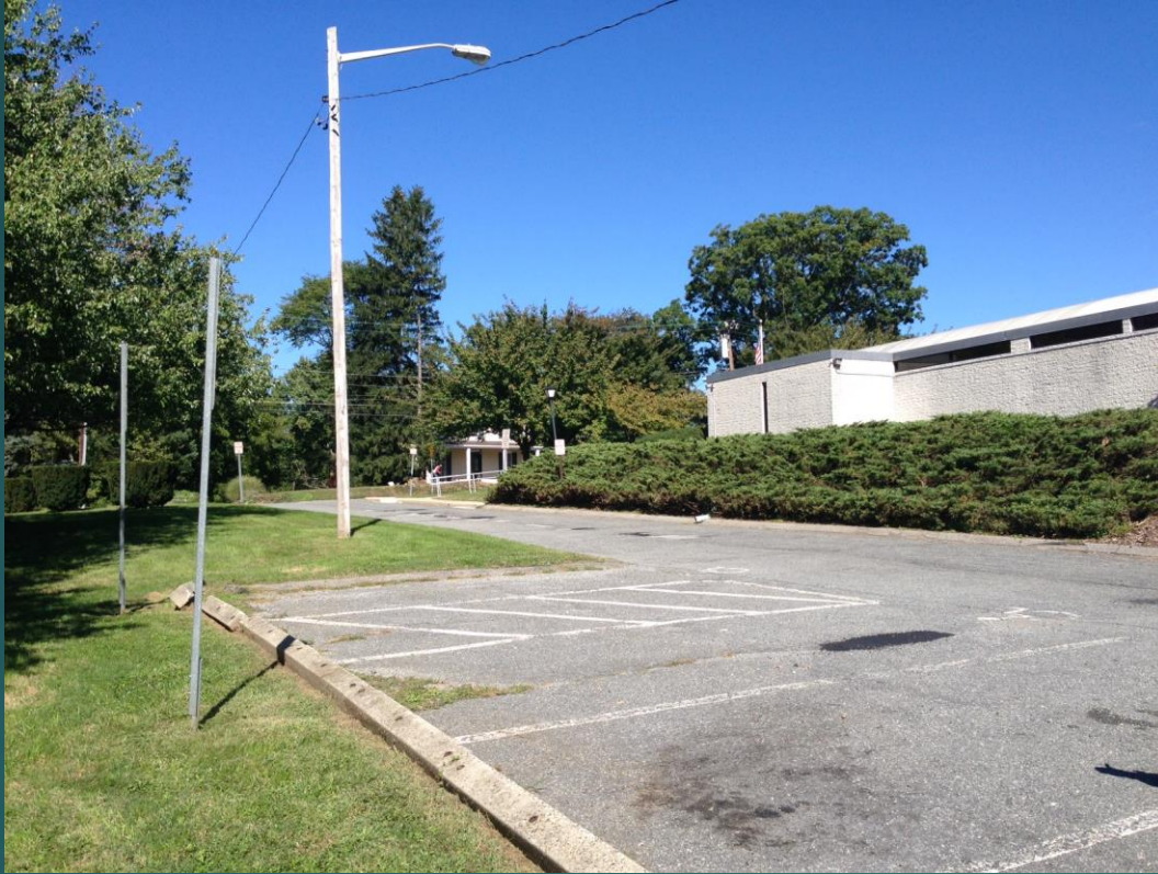
Significant incline to entrance