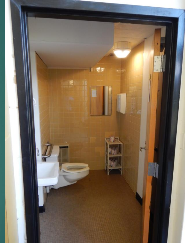
Not ADA compliant